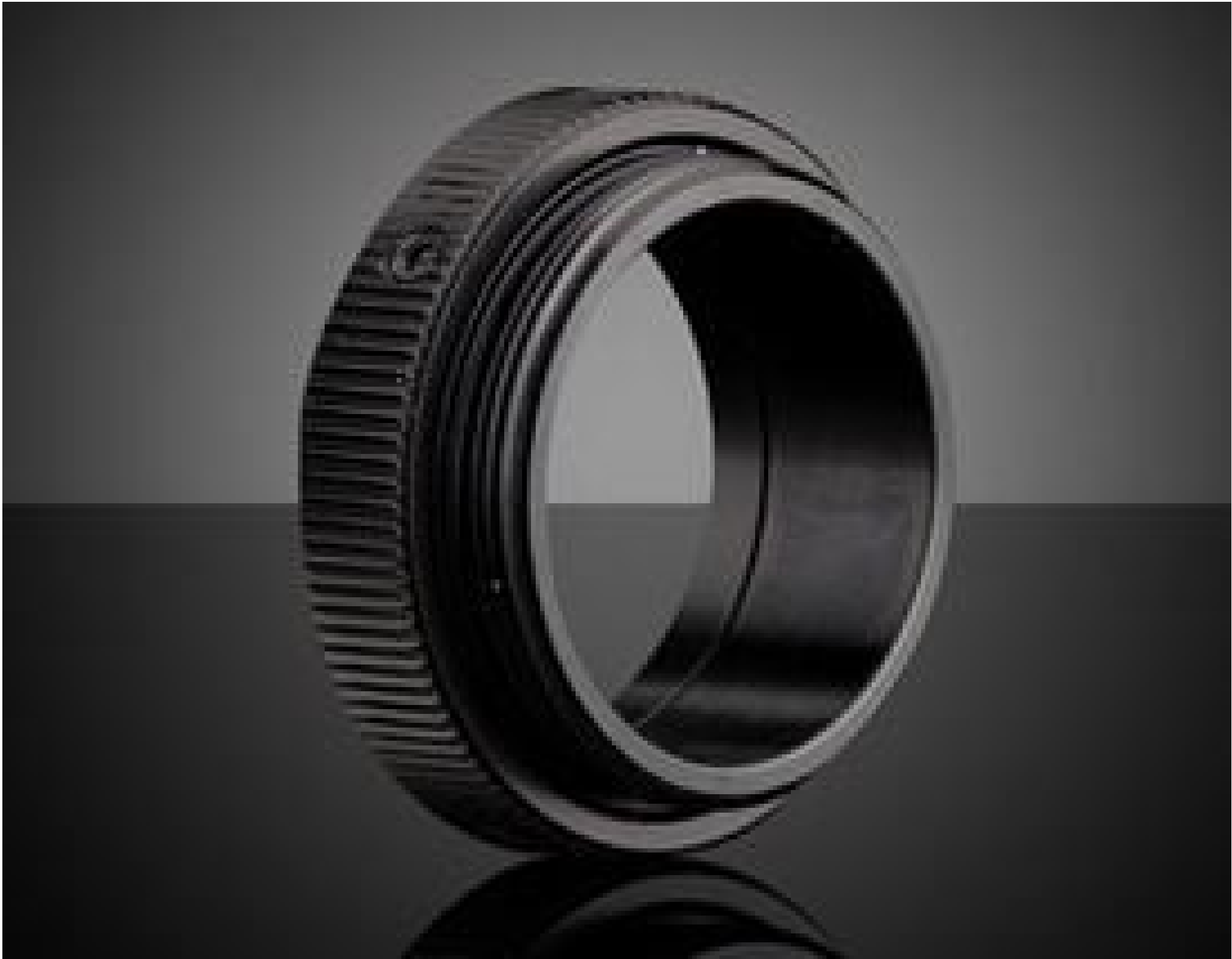
#66-381: M25.5 x 0.5 to C-Mount Rotating Male Adapter