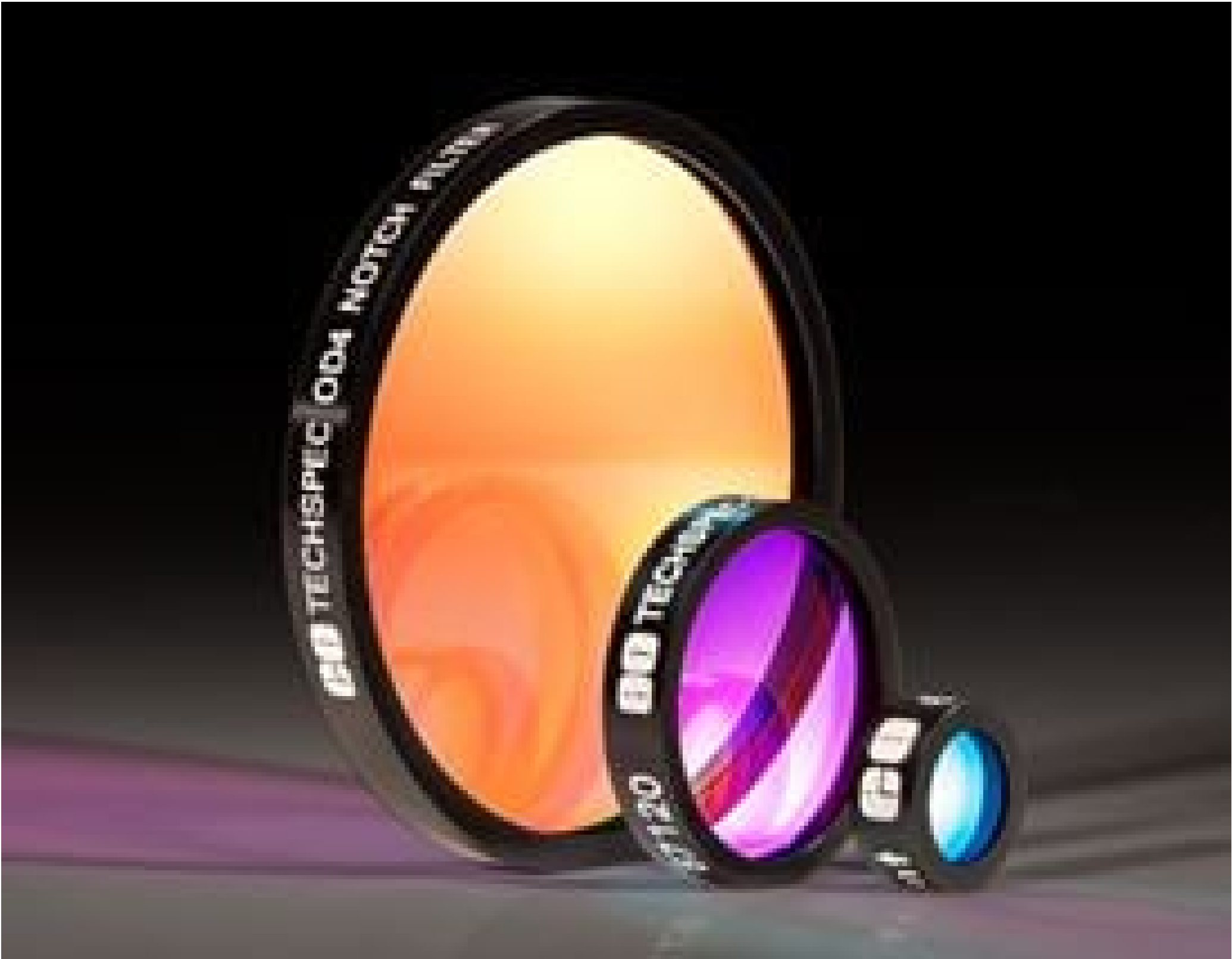
TECHSPEC OD 4.0 Notch Filters