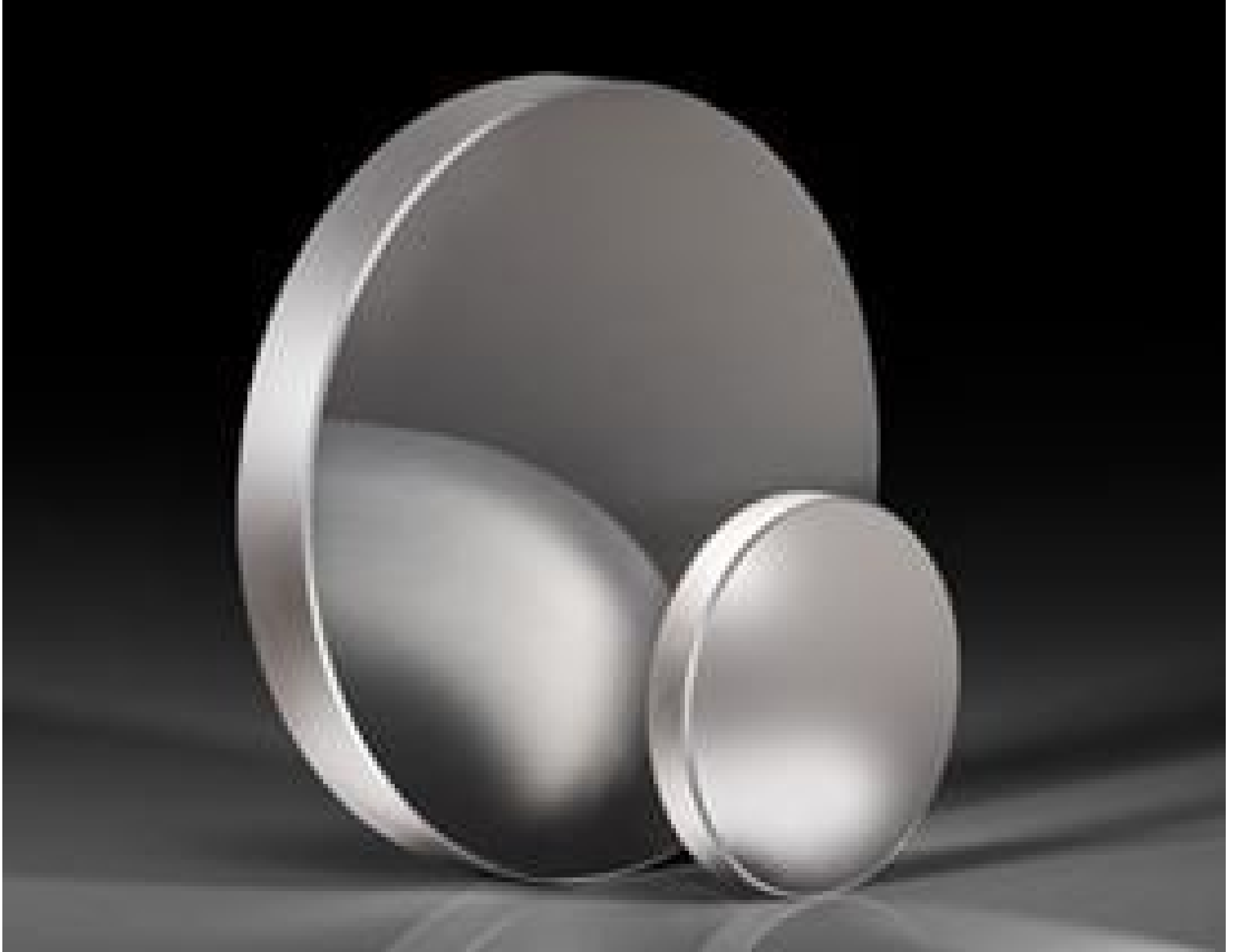
TECHSPEC® Ultrafast-Enhanced Silver Concave Laser Mirrors